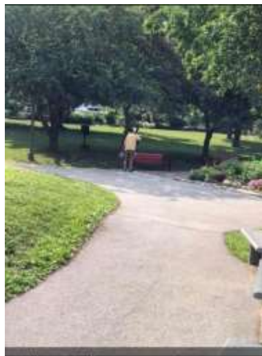
Trustee 1 st year, Bill Bressette, helping to pick up cigarette butts at Taylor Park (St. Albans).

Over 15,500 cigarette butts picked up in two hours, and with 27 volunteers